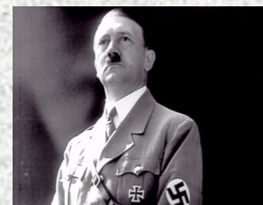
Adolf Hitler - Germany

Neville Chamberlain. British Prime Minister at the outbreak of war.